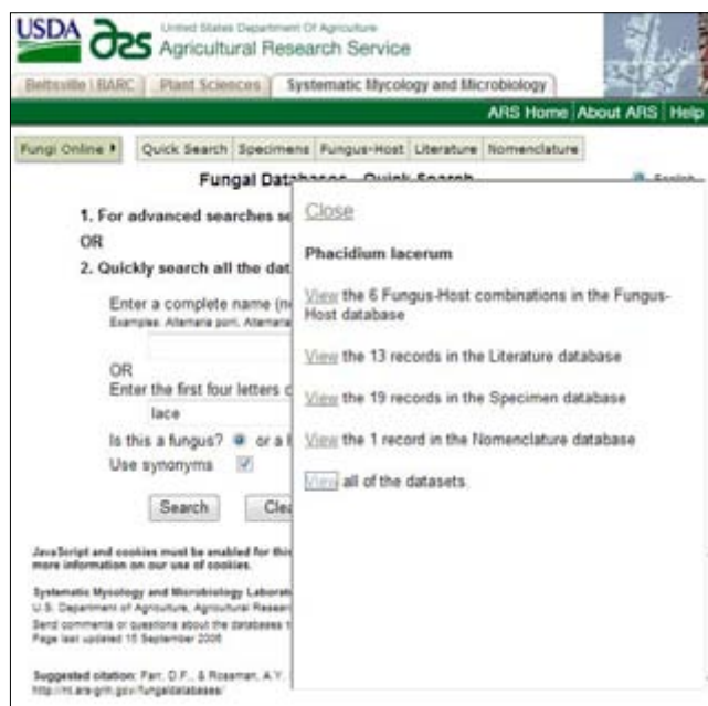
Fig. 5. SMML Fungal Databases http://nt.ars-grin.gov/fungaldatabases/ Search for nomenclator and associated data for Phacidium lacerum .

The principle of priority applies at all ranks of family and below, i.e. the oldest family name has priority unless conserved.