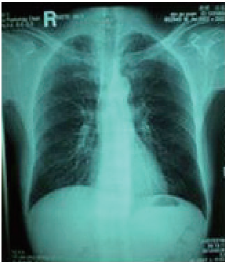
Fig. 1. Radiograph of the lungs: lung markings of both lungs are increased and thick; mottled, unclear edges and diffuse distribution of high density material in the bilateral lungs are visible. The radiograph is consistent with early silicosis.

Thereafter, we performed bilateral artificial total hip arthroplasty. During the operation, we found that the capsula articularis coxae, synovial membrane, and articular cartilage of the bilateral femoral head, as well as the vessels of bilateral greater trochanter, were black (Figs. 2 and 3). These specimens were sent for pathological examination. Pathological examination (immunohistochemistry) and po-