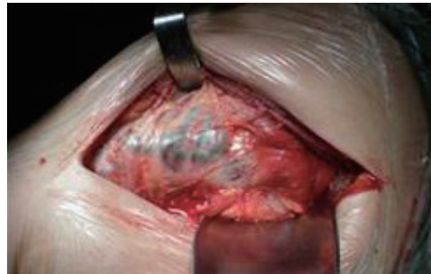
Fig. 3. Black substances in vessels of the left greater trochanter.

In modern medicine, silicosis is considered an illness with main manifestations of lung fibrosis due to inhalation of overconcentrated \text{SiO}_2 dust. 1 \text{SiO}_2 dust destroys alveolar macrophages, thus inducing pathological changes indicative of silicosis. So far, there has been no case report about \text{SiO}_2 deposits in vessels or cartilages. The anatomical factors of the femoral head and neck are beneficial to silica deposition. First, the femoral head is widely covered by articular cartilage, thus making its blood supply the end of the