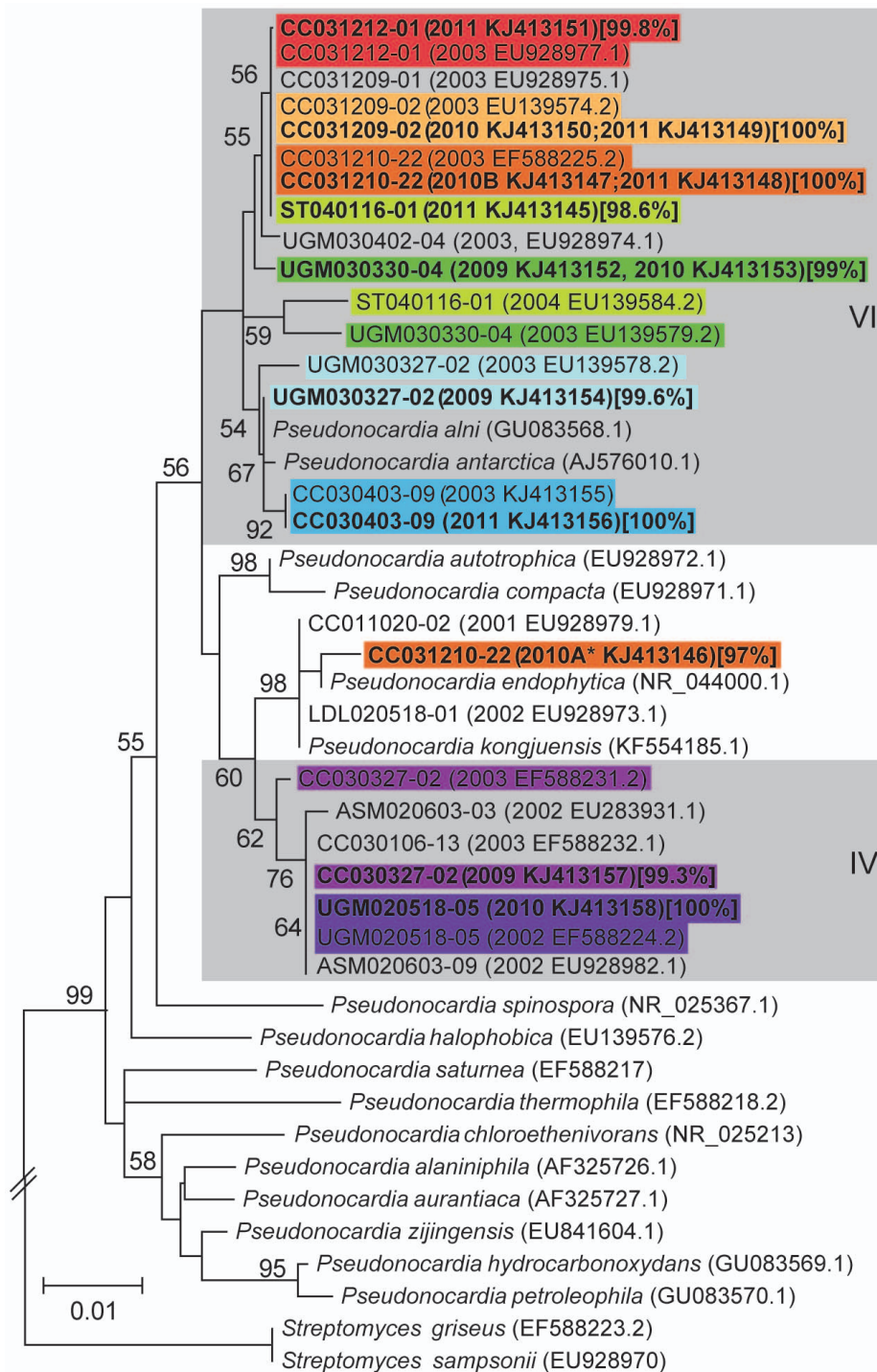
Figure 3. 16S Pseudonocardia phylogenetic tree. A phylogeny showing bacterial sequences associated with individual leaf-cutting ant colonies over time and their free-living relatives ( italics ). The phylogenetic tree was generated by the maximum likelihood method based on the Tamura-Nei model and bootstrapped 1000 times. The scale bar represents the genetic distance between samples, reflecting the number of nucleotide changes per site. The tree was created from 16 S rDNA sequences of Pseudonocardia exosymbionts obtained from leaf-cutting ants at the time of colony collection (regular text) and up to 9 years later (bold text). Year(s) of isolation noted in parenthesis after the colony code. Identical sequences obtained at different times are represented by a single sequence with multiple dates. Clades of Pseudonocardia associated with leaf-cutting ants are labeled with roman numerals [8,19] and depicted in grey boxes. Ant-isolates are labeled by colony number, followed by the year isolated and GenBank identification number in parenthesis. The percentage sequence identity with original isolates is given in brackets after all re-isolates. Isolations from the same colony are boxed in the same color to facilitate comparison. Note that bacteria isolated from all colonies remain in the same phylogenetic clade over time, with the exception of a different morphological type (*) isolated once from a colony with two other independent re-isolates identical to the original sequence isolated.