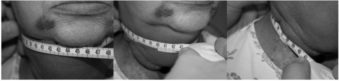
Figure 2. Left to right: Composite neck measurements shown in Table 2