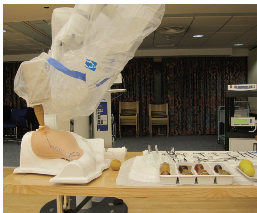
Figure 1 Simulator for training in the TARGIT Academy. The Intrabeam with applicator has been placed into the tumour bed of the simulator, and a purse-stitch applied. TARGIT, targeted intra-operative radiotherapy.

medical physicists and other members of the multidisciplinary team. As the success of this technique depends on multidisciplinary team working harmoniously with each other, the training is available only to teams and not individuals. At the outset it was felt important that the entire team should listen to some of the detailed specialist instructions so that they can appreciate the roles of their colleagues more fully. For example, many of the surgeons will be unfamiliar in the use and handling of the IORT device, selection of an appropriate applicator and adequate placement in the tumour bed; it is important that the entire team are aware of these “surgical” details, as they can have a bearing on other aspects of patient management.