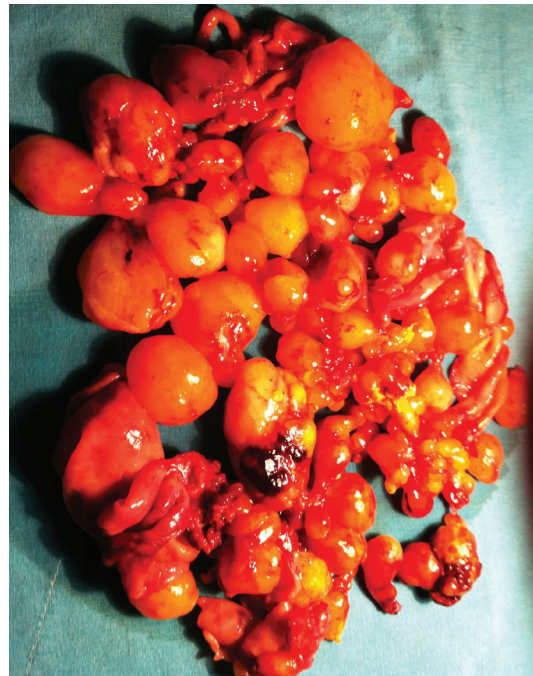
FIG. 2. Laparotomy revealed the mass in the lower abdomen, which originated from the left sacrouterine ligament and measured 18 cm. The solid mass is covered by a cystic wall, which is seen as a pink tissue