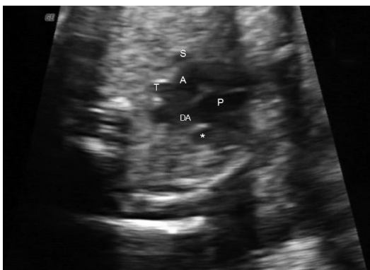
FIG. 1. Three-vessel-trachea view. Asterisk shows the persistent left superior vena cava located left of the pulmonary artery and ductal arch. (P: pulmonary artery; DA: ductal arch; A: aorta; T: trachea; S: superior vena cava)

This study was approved by the Institutional Ethics Committee of Istanbul Faculty of Medicine. Informed consent was obtained from all participants. The clinical data retrieved from hospital records, ultrasound reports and prenatal diagnosis databases include maternal age, gestational age at diagnosis, fetal gender, sonographic cardiac and extracardiac findings, genetic analysis, and outcome of pregnancy. The conditions associated with heterotaxy such as malposition of the abdominal viscera were not taken into account as extracardiac malformations. If prenatal or postnatal chromosome analysis was not performed, the karyotype was considered to be normal in healthy infants with no clinical findings. Prenatal diagnosis was confirmed by postnatal echocardiography or cardiac surgery in all surviving patients, and by autopsy in case of termination of pregnancy (TOP) or in utero death, except for the cases in which parents did not accept postmortem examination. For the five patients who did not attend to our hospital for postnatal examination, data regarding outcome was obtained by contacting the parents by telephone. The outcome was considered favorable if the infant was alive and doing well, while TOP, in utero death and neonatal death constituted unfavorable outcomes. Statistical analysis was performed using Fisher's exact test and the Mann-Whitney U test. All values are given as mean±SD. p < 0.05 was considered to be significant.