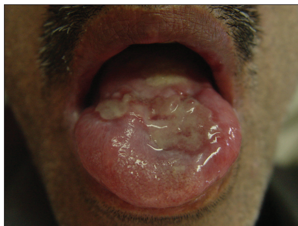
Figure 3: Primary after treatment