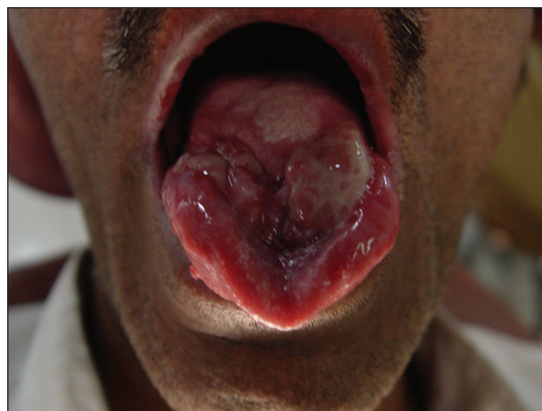
Figure 1: The pyogenic granuloma over the dorsal surface of the tongue

Clinical examination revealed a reddish-yellow exophytic, pedunculated mass which centered on the dorsal surface of tongue, measuring 4 \times 3 \times 1 cm 3 in size. The lesion was lobulated with a smooth surface. The base of the lesion was so tightly stuck to the bed that the interface was always slightly bloody [Figure 1]. Neither any traumatic factor in the oral cavity, nor palpable cervical lymph nodes were detected. The diagnostic hypotheses were hemangioma, angiosarcoma, inflammatory hyperplasia, and PG.