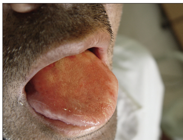
Figure 4: One year after treatment

histopathological picture of the extralingival PG is quite similar to gingival or any part of the body.