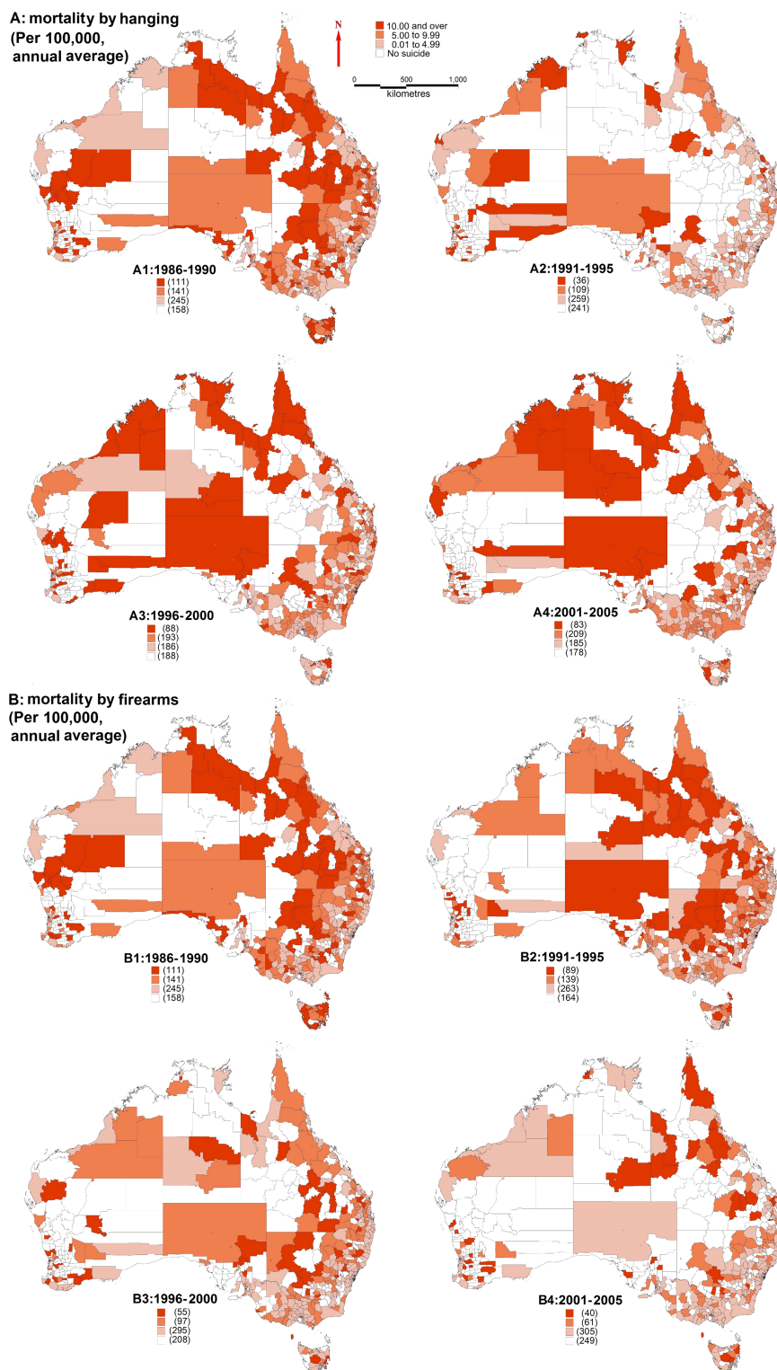
Figure 4 Suicide rates by self-harm over time and across space in Australia (1986–2005).

firearms nationally. 34 Our study found a sharper decline in male suicide rates by firearms for the period 1991–1995 to the period 1996–2000 than for earlier periods (eg, the period 1991–1995 compared with the period 1986–1990), suggestive of a sustained impact of the firearm law enforcement after 1996. 31 Other studies have suggested that the decreased firearm suicide rates in young adults were accompanied by rising suicide rates