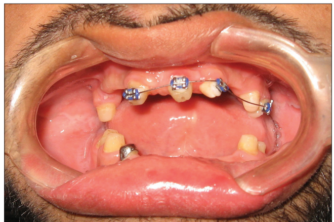
Figure 6: Orthodontic treatment