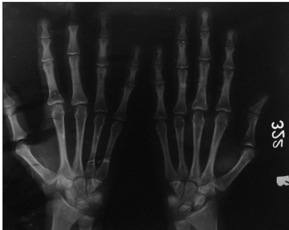
Figure 5: Hand wrist radiograph