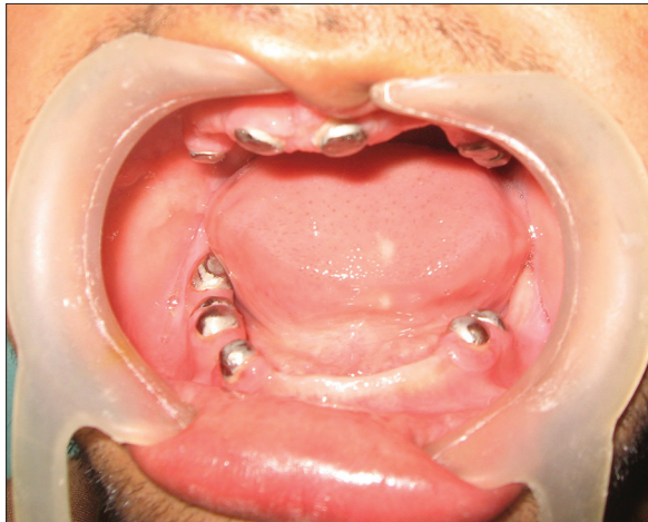
Figure 3: Pre-operative intraoral findings