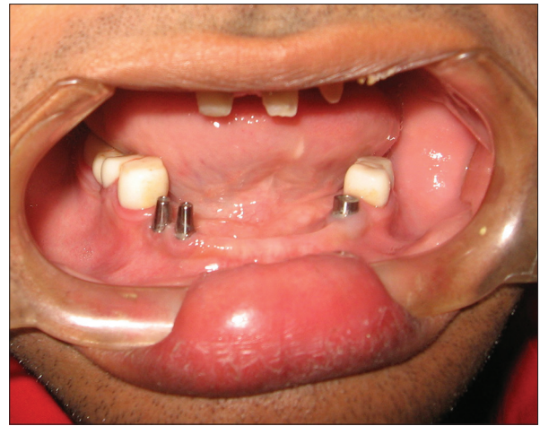
Figure 7: Implants with abutments

Removable prosthesis is the treatment of choice over FPDs or implants during the growing age to accommodate the growth of jaws. However, evidence supporting the claim that implants placed in ED patients younger than 18 years