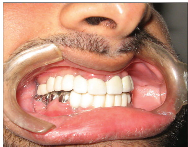
Figure 9: Clinical photograph showing the completed restoration

have high-risk of failure is very scarce. [23] Moreover, the anterior region of the mandible is regarded as transversely stable by the age of six years. [25,26] Hence, a careful selection