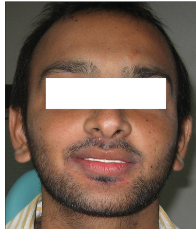
Figure 8: Patient after final prosthesis