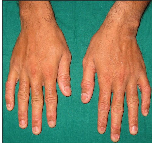
Figure 2: Dry skin and abnormal nails