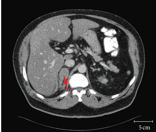
FIGURE 1: Abdominal computed tomography (CT) scan revealing a 3.6 \times 2.7 cm mass (red arrow) involving the right adrenal gland.