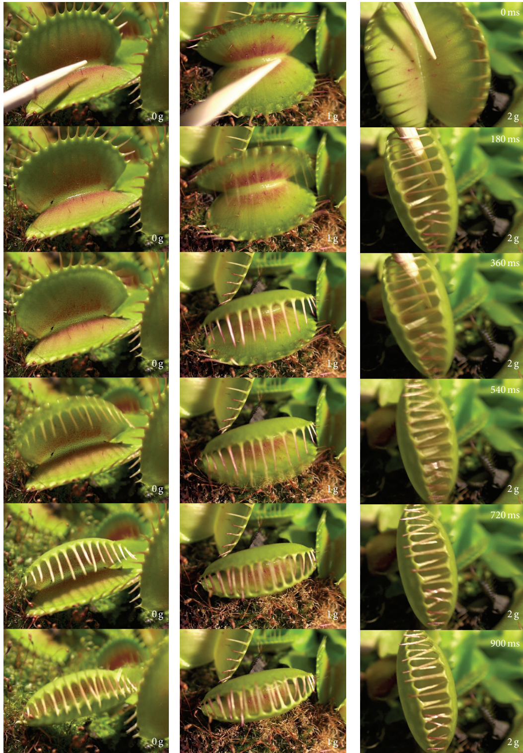
FIGURE 1: Closing of the trap in micro- (0 g), normal (1 g), and hypergravity (2 g).

the trap closure suggest an alteration in the generation or propagation of the APs in microgravity. In plants, as well as in animals, action potentials are induced by the fast opening and closing of ion channels whose functionality has been little studied and understood in microgravity so far. In fact,