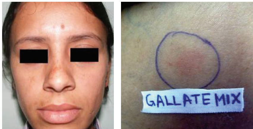
FIGURE 4: A patient with malar pattern of melasma and positive reaction from gallate mix.

changes too have been ascribed to its use. Dandale et al. [21] documented positive reactions from PPD in 8.6% patients of facial melanosis. Mehta et al. [27] also described a case of pigmented contact cheilitis from PPD. Our 2 patients and one control had positive reaction to PPD but never had clinical contact dermatitis despite using hair colors in the past or perhaps being subtle clinically it remained unnoticed. Jasmine synthetic, chloroacetamide, isopropyl myristate, vanillin, bronopol, sorbic acid, 2-(2-hydroxy-5-methyl-phenyl) benzotriazole, germall 115, hexamine, quaternium 15, geranium oil, butylated hydroxyanisole, and triethanolamine, the common additives to cosmetics/skin care