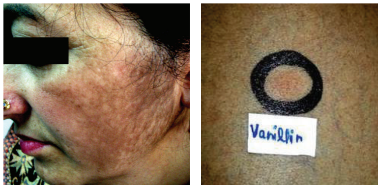
FIGURE 6: Positive patch test from vanillin in a patient with diffuse-to-reticulated mandibular pattern of melasma.

it is possible that our patient was sensitized from other cosmetics or pharmaceuticals used in the past. The reported sensitivity from isopropyl myristate, an emollient, fragrance, and skin-conditioning agent, was 1.2% in 244 patients with cosmetic contact dermatitis in a study from Israel [29]. Although our patient showed positive patch test reaction from isopropyl myristate, cosmetic cream itself did not elicit positive reaction in her despite isopropyl myristate being one of the listed ingredients in “Fair & Lovely” cream that she had been using for over 6 years. Perhaps this ingredient is present in much lower concentration in finished cosmetics product than used for patch testing. Although vanillin, a substituted aromatic aldehyde and a fragrance, is known to induce skin sensitization in humans [30], it is often considered secondary allergen in patients sensitized to Myroxylon pereirae and positive reactions to vanillin (pure or 10%) were reported in 8/142 and 21/164 of such patients [31]. Vanillin elicited positive reaction in a female (Figure 6) who had been using various cosmetics (cold creams, soap).