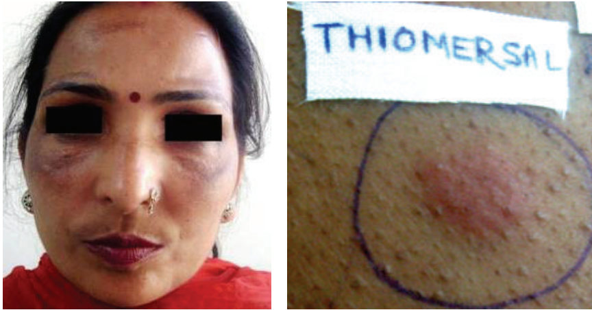
FIGURE 5: A patient with centrofacial melasma and positive reaction from thiomersal.