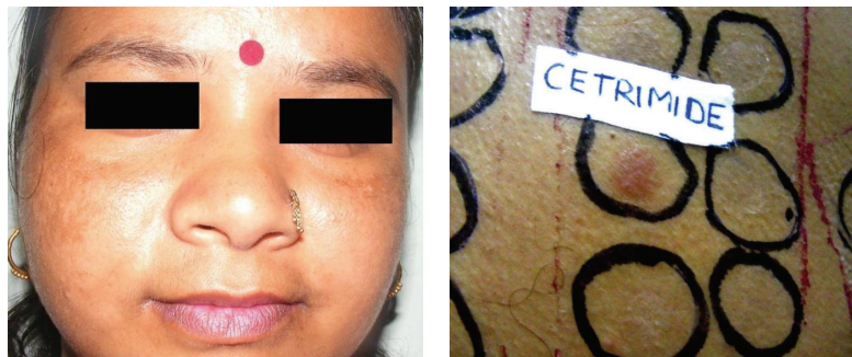
FIGURE 3: A patient with malar pattern of melasma and positive patch test from cetrimide.