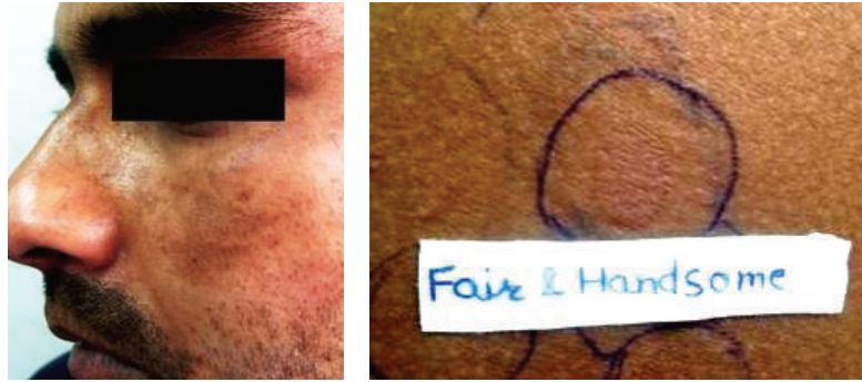
FIGURE 2: Irritant patch test (Janus type) reaction from Fair & Handsome cream in a male with malar pattern.