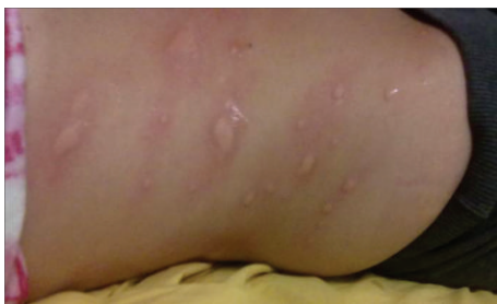
FIGURE 3: Cold-induced skin rash in a young patient with NLRP12 -associated autoinflammatory disorder.

to finger deformities and ankylosis [82, 83]. More than 90% of patients have variable skin rashes, although ichthyosis-like changes are the most commonly observed [77]. Eye involvement, generally in the form of recurrent panuveitis, and often evolving towards chorioretinitis, glaucoma, and