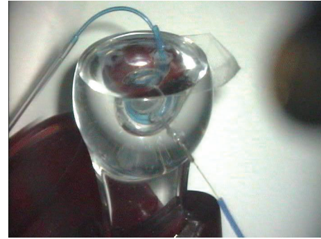
FIGURE 1: Cochlear model with positioned sensor and an inserted probe electrode.

With an insertional speed of 0.1 mm/sec the pressure was 0.43 mm Hg, SD 0.058 mm Hg. For a speed of 0.25 mm/sec, we observed 0.51 mm Hg, SD 0.076 mm Hg. With a speed of 0.5 mm/sec, we measured 0.79 mm Hg, SD 0.156 mm Hg. For a speed of 1 mm/sec, the pressure was 1.2 mm Hg, SD 0.14 mm Hg. At 2 mm/sec, the pressure was 1.27 mm Hg, SD 0.110 mm Hg (Figure 2). The low values of the standard deviation indicate the good reproducibility of the experimental setup.