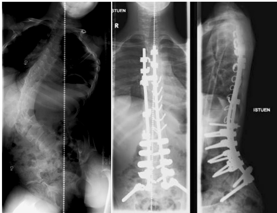
Fig. 1 14-year-old boy with cerebral palsy (CP; spastic tetraparesis) and severe neuromuscular scoliosis. Anteroposterior spinal deformity correction with hybrid instrumentation provided excellent and stable correction at the 2-year follow-up