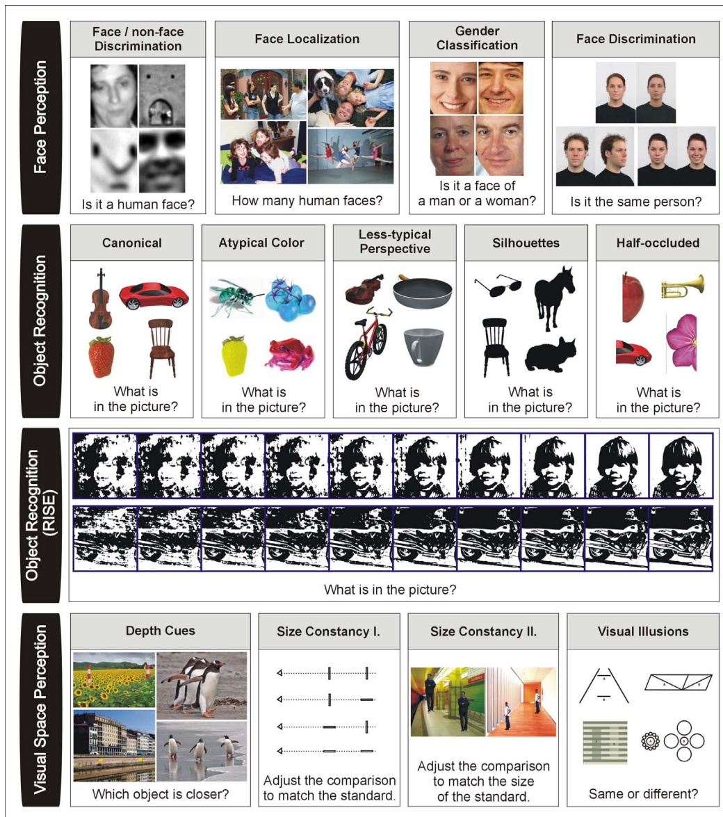
Figure 1. Sample stimuli from all the tests conducted with KP (six and eight months after his sight-recovery operation), MM (12 years after his sight-recovery operation) and the control subjects.

(iv) susceptibility to context-induced visual illusions, as a test of the ability to see the stimulus configuration as a perceptual whole. Because of time constraints, these visual space perception tasks were not performed with MM.