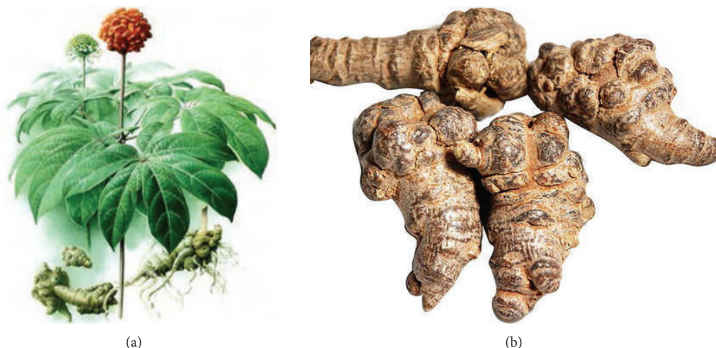
FIGURE 1: Morphology of Radix notoginseng. (a) Whole plant; (b) roots for pharmaceutical use.

Panax [3]. Most of these monomer components are 20(S)-protopanaxadiol and 20(S)-protopanaxatriol. But oleanolic acid-type saponins were not found, which was different from the same plant ginseng and American ginseng [4]. There are also a lot of same monomers compared with ginseng and American ginseng saponins, such as ginsenosides Rb1, Rb2, Rb3, Rc, Rd, Re, and gypenoside. Among them, the content of Rg1 and Rb1 is higher, as the main saponins of radix notoginseng [5]. Ginsenoside Rb1 can promote the formation of nerve fibers and maintain its function to prevent sexual dysfunction, depress central nervous system, promote serum protein synthesis, promote cholesterol synthesis and decomposition, and inhibit the decomposition of neutral fat and antihemolytic reaction [6]. Ginsenoside Rg1 can excite central nervous system, prevent sexual dysfunction, enhance memory, eliminate fatigue, promote DNA and RNA synthesis, and inhibit platelet aggregation [7]. Physiological activity of ginsenoside Rc is mainly inhibiting the central nervous system, so that may cause nerve trance phenomena. Compared with ginseng and American ginseng, Panax consists of more Rb1 and Rg1, but without Rc. Therefore, taking Panax has kind of strong tonic effect, without the ginseng-induced trance-like effect [8].