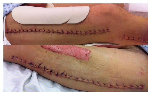
Figure 2 Closed wounds of the lower limbs (right/left) 10 days after wound closure.

After 60 days of treatment he was discharged from the clinic. He was able to return to his previous place of work and reached the same level of athletic activity as before the illness.