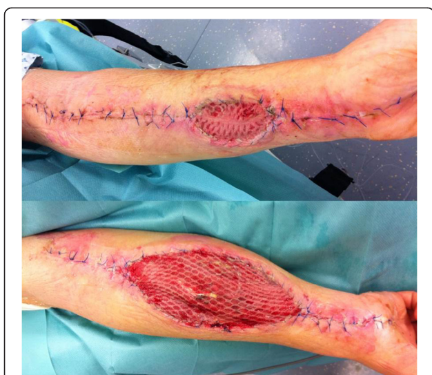
Figure 3 Closure of the upper limbs with skin grafting (right/left) 10 days after wound closure.