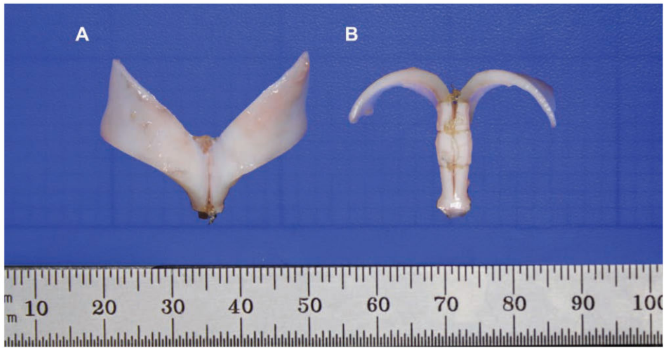
Figure 3. The completed model is shown, with nylon sutures securing the bisected septum. (A) Frontal view. (B) Base view.