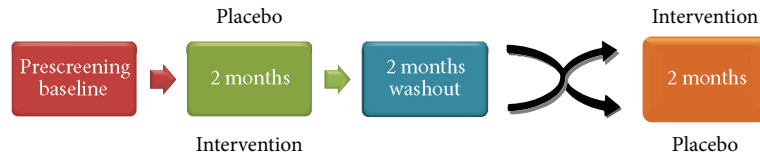
FIGURE 2: Study design.

study in CKD stages 3 and 4 patients at Thomas Jefferson University (Philadelphia, PA) [31] and the current study. The former study aimed to confirm the safety and tolerability of several doses of the formulation as well as to quantify the improvements in quality of life (QOL) and to explore several molecular biomarkers. The primary goal of the current study was to confirm the efficacy of the formulation in effecting a measurable quality of life improvement and reducing the levels of commonly known uremic toxins. The secondary goal was to investigate the product’s effects on some inflammation and oxidative stress biomarkers.