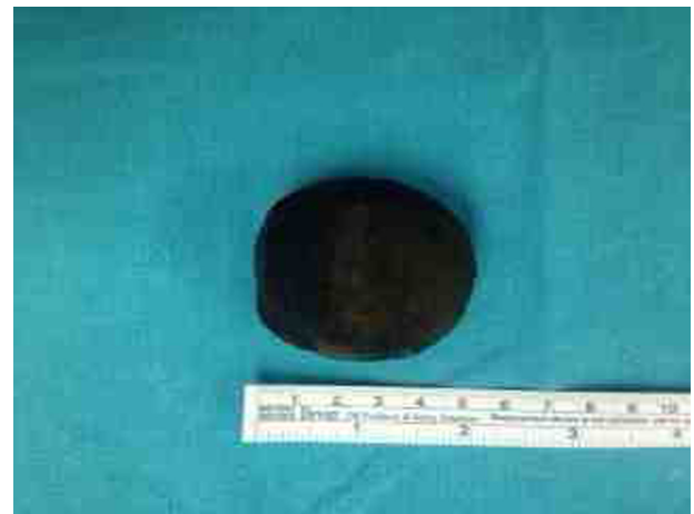
Figure 3. A 5 \times 4 \times 3 cm gallstone extracted from jejunum.

which could increase the complication rate and cause delays in the diagnosis. 4,5