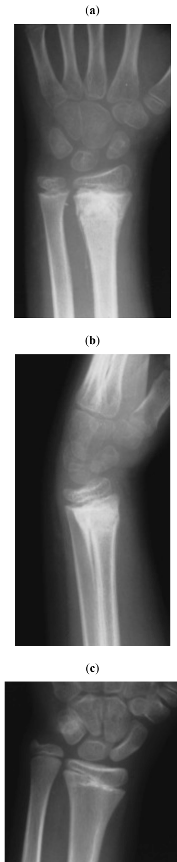
Fig. (6). Anteroposterior (a) and lateral (b) radiographs of a 9-year-old boy 5 weeks post-injury indicated a type 1 fracture with signs of periosteal healing. Diagnosis was changed to a type 5 lesion after the radiographic appearance of a bone bridge one year later (c).

inclusion criteria are according to Peterson [7], meaning that the fracture involves all cortical surfaces of the diaphysis or metaphysis and extends to the physis, but there is no fracture along the physeal plate, so attachment of the epiphysis with the metaphysis is not disrupted. The transverse diaphyseal or metaphyseal fracture may be angulated or displaced.