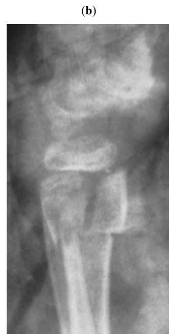
Fig. (4). Anteroposterior (a) and lateral (b) radiographs of an 11-year-old boy indicated a displaced type 3 fracture.