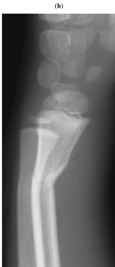
Fig. (2). Anteroposterior (a) and lateral (b) radiographs of a 10-year-old boy indicated an angulated type 1 fracture.