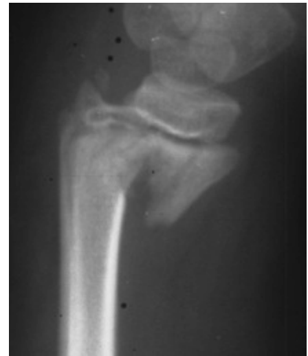
Fig. (3). Lateral radiograph of a 9-year-old girl indicated a displaced comminuted type 2 fracture.