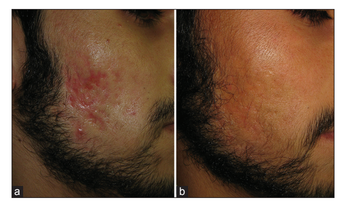
Figure 2: (a) Predominantly rolling scars (b) Excellent response after 3 sessions of fractional CO<sub>2</sub> laser resurfacing