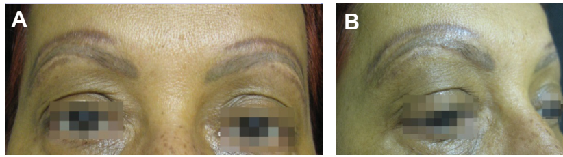
Figure 2 Patient 2.

Notes: Aspect before treatment. (A) Frontal view, (B) lateral view.