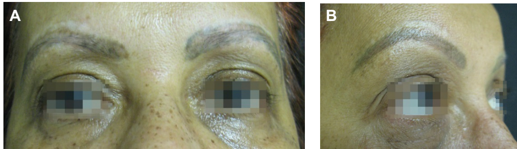
Figure 3 Patient 2.

Notes: Aspect before treatment. (A) Frontal view, (B) lateral view.