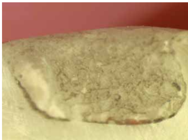
Fig. 3: Score 4: Dye penetration involving the axial wall