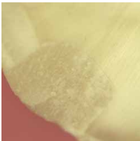
Fig. 1: Score 0: No dye penetration