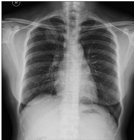
Figure 1: Chest X-ray showing coin shadow

myofibroblasts and marked inflammatory infiltration, predominantly plasma cells. IMT is also known as plasma cell granuloma, xanthogranuloma, inflammatory pseudotumor, and fibrous histiocytoma. [1] IMT is very rare with an incidence of approximately 0.04-1% of all the pulmonary neoplasms. Other common sites are mesentery, omentum, larynx, liver spleen, and breast. The clinical and imaging characteristics of this lesion are similar to that of a neoplasm. The biological behavior and the tendency of spontaneous regression is suggestive of a benign nature. Some reports suggest IMT may be a neoplastic disorder and few cases of metastasizing IMT have also been reported. [2]