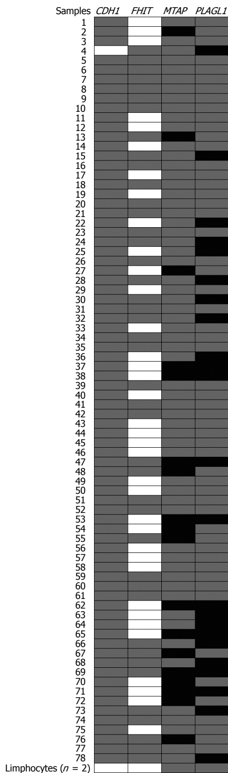
Figure 2 Methylation status of CDH1 , FHIT , MTAP and PLAGL1 promoter in the samples studied. White boxes represent samples that showed only unmethylated sequences, gray boxes represent samples that showed unmethylated and methylated sequences, and black boxes represent samples that showed only methylated sequences. 1-13 samples: nonneoplastic; 14-43 samples: intestinal-type GC; 44-78 samples: diffuse-type GC.

plastic samples were hypermethylated in CDH1 promoter (Table 3), frequencies higher than those in the literature. CDH1 methylation status was not significantly different between GC and nonneoplastic samples. This is the first study that has evaluated CDH1 methylation frequency in