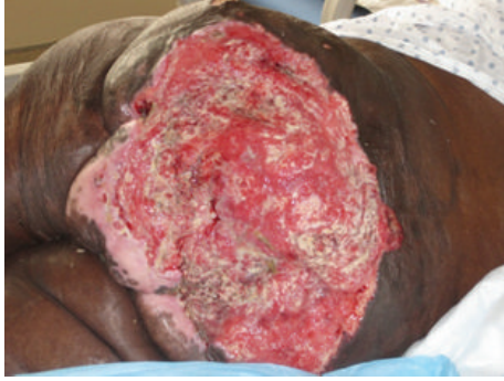
FIGURE 1: 16 × 27.5 cm friable ulcer with fibrinopurulent exudate and exophytic, granulation tissue centrally and peripherally.

2.2. Histology. The skin specimen was routinely processed after fixation with formaldehyde and stained with hematoxylin and eosin at the Dermatopathology Laboratory at New York Presbyterian Hospital-Columbia.