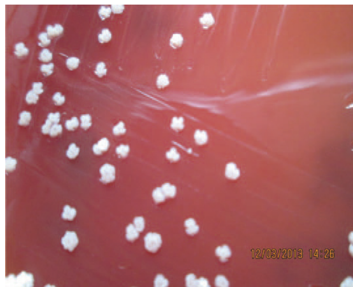
[Table/Fig-2]: "Molar tooth" appearance of colonies on Blood Agar (Anaerobic Culture in Candle Jar)