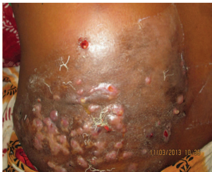
[Table/Fig-1]: Lesion over the back showing multiple nodules and some discharging sinuses

On inspection, the patient had a large plaque like lesion about 12 cm x 8 cm over the left side of the back. Overlying skin was scarred in places with papules and nodules. Multiple discharging sinuses draining sero-sanguinous fluid were scattered all over the lesion [Table/Fig-1]. On palpation the lesion was fixed to the underlying muscle and the overlying skin was adherent. The margins were well-defined in some places and progressive in others. There were some satellite nodules which were woody hard in consistency and mostly non tender. Local temperature of the lesions was not raised.