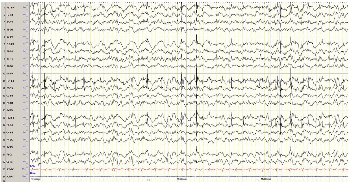
Fig. 2. EEG with generalized epileptiform discharges and associated myoclonus before initiation of perampanel.