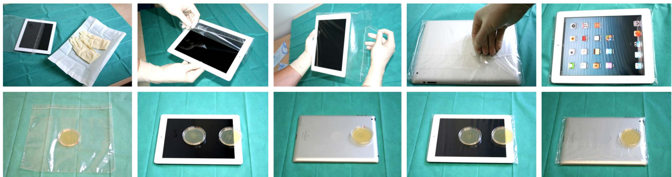
Figure 2. Illustration of the wrapping of the tablet and the sample collection. Upper row illustrates wrapping of the tablet computer using a sterile drape cloth and sterile gloves (Step 1). Lower row illustrates sample collection from an unused plastic bag, from the surface of the tablet and from the outside of a used plastic bag using Rodac plates (Step 1 and 4). The Rodac plates are positioned on the three defined regions of interest (ROIs; ROI A = central touchscreen, ROI B = home button and its adjacent area, ROI C = upper central backside). doi:10.1371/journal.pone.0106445.g002

to the Microbiology Institute. During transportation the plates were packed in an isolated bag. The transport took about 5 minutes (850 meters). In the Microbiology Institute the plates were incubated at 36^{\circ}\text{C} \pm 1^{\circ}\text{C} for 48 hours under aerobic conditions. After incubation the plates were read by a specialist in microbiology and hygiene. Subcultures were done if necessary. Visible colonies were identified by standard microbiological methods (colonial morphology, gram stain, catalase test, oxidase test, clumping factor/coagulase test) and by matrix assisted laser