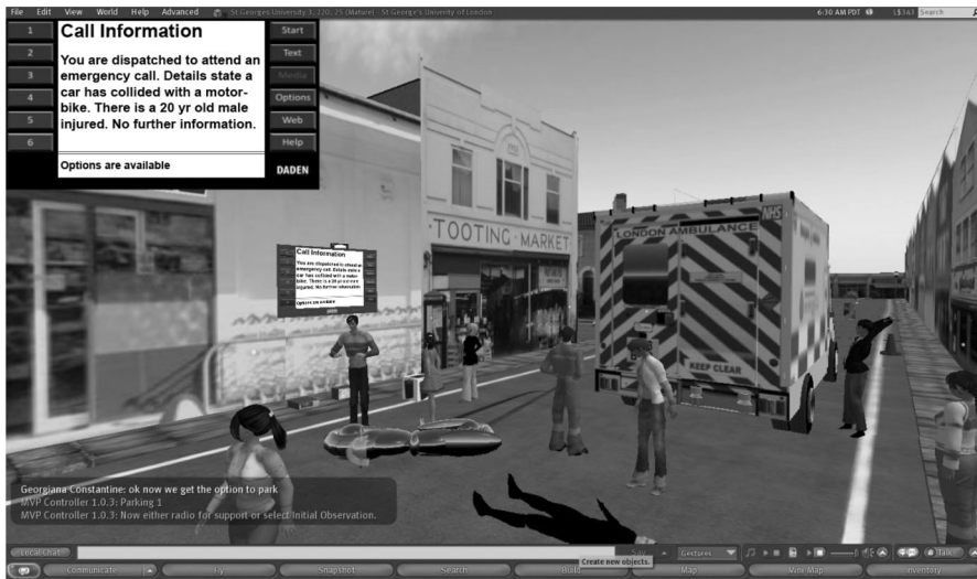
Fig. 2 Second Life Street Accident Scenario with the patient mannequin on the floor near his motorbike

Evaluation Illuminative evaluation was used [9]. Data collection involved observation by an external evaluator and interviewing staff and students to explore and examine the interviewee's perceptions. The objectives of the evaluation were to explore the impact of PBL in virtual worlds on learning and assess the usability of the learning environments. The result showed that: