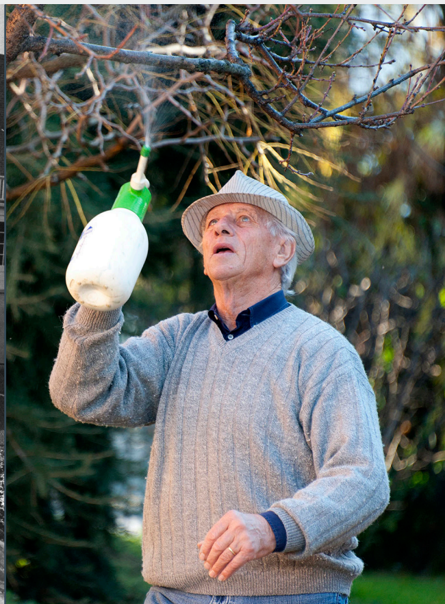
Left to right: © George Silly/Getty; © Rudi Gobbo/Getty

occupationally, but some epidemiological studies suggest there is also potential for adverse effects from ambient environmental exposures. 22