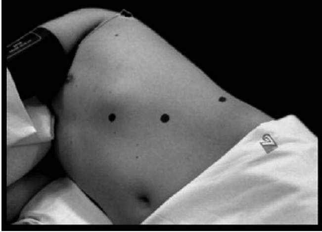
Figure 1. Trocar positions.