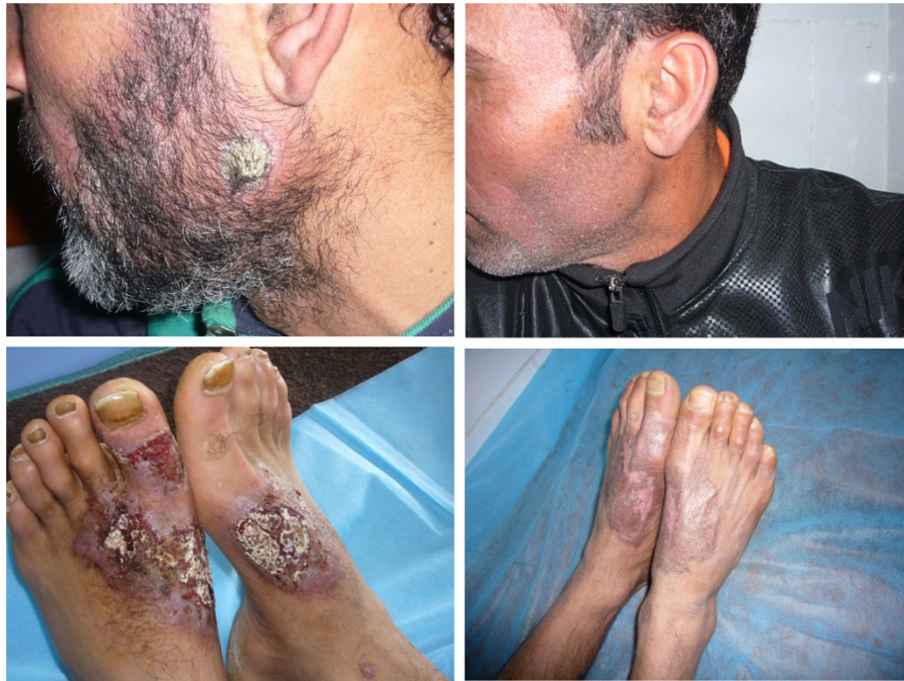
Figure 1 Painless crusted nodule over left cheek at angle of mandible and bilateral asymmetrical large well-defined erythematous ulcerated plaques with crusts over dorsa of feet (left images). Complete healing after two months treatment by Rifampicin and Isoniazide (right images).

with acute contact dermatitis with secondary bacterial infection. However, a 2 mm punch biopsy and slit-skin smear was obtained from all lesions. Smears were fixed and stained with Giemsa's stain. Leishmania parasites were heavily seen inside and outside infected macrophages (Figure 2). Molecular identifications of the causative Leishmania species by amplifying the internal transcribed spacer1 (ITS1-PCR) [1] failed due to PCR inhibition problems. After parenteral administration of sodium stiboglyconate (Pentostam) (20 mg/kg/day) for 28 days the lesions did not show any marked improvement, and skin-slit smears were positive for Leishmania