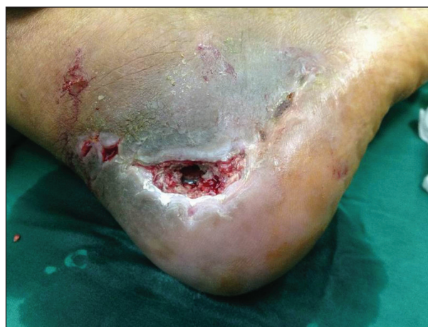
Figure 1: A male patient with many years of smoking history, with wound dehiscence and skin flap necrosis 8 weeks after surgery. Bacteriological culture showed that the infection was caused by methicillin-resistant Staphylococcus aureus

The lateral extensile L-shaped incision is widely used in the treatment for calcaneal fractures. It provides adequate exposure and convenience for subtalar articular surface reduction. However, it is associated with a high incidence of incision complications, which if mishandled will not only make patients suffer, but also increase hospitalizations and expenses. Moreover, for some patients with severe infections the internal fixator must be taken out