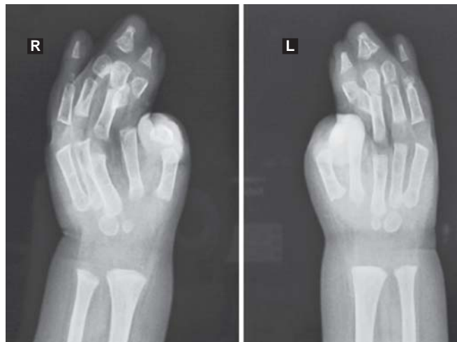
Fig. 6: Hand-wrist radiograph showing soft tissue syndactyly of all the digits and synostosis involving phalanges of second, third and fourth digits and metacarpels of both the hands