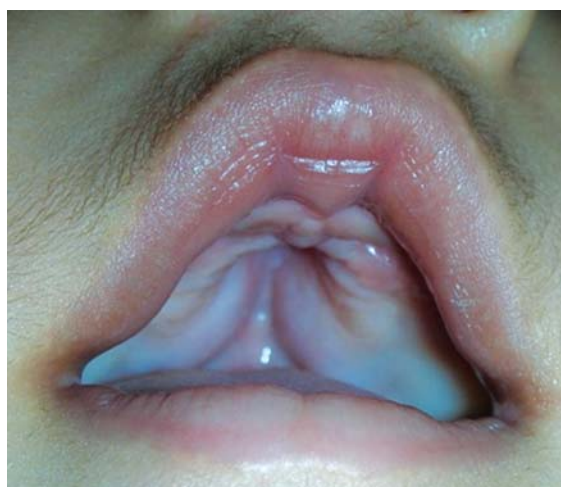
Fig. 5: Deficient premaxilla, V-shaped maxillary arch, pseudocleft, cross bow-shaped lips