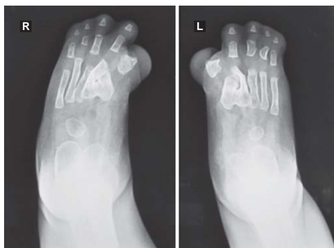
Fig. 7: Soft tissue fusion of all the digits and synostosis of the metacarpals of both the feet with deformed great toes

Radiographs of both hands and feet showed soft tissue syndactyly of all the digits and synostosis involving phalanges of second, third and fourth digits of both the hands and the metacarpals of both the hands and feet with a deformed great toe (Figs 6 and 7). Anteroposterior skull radiographs revealed fused coronal sutures, turribrachycephalic skull contour, bitemporal widening, hypertelorism and increased convolutional markings. Three-dimensional CT reconstructions in a superoinferior view showed a midline defect extending from glabella to posterior fontanelle with abnormally wide anterior and posterior fontanelle (Fig. 8). Bilateral symmetric synostosis of coronal and lamdoid sutures was also present (Fig. 9). Axial sections at level of plexus choroideus showed agenesis of corpus callosum. All findings were diagnostic of Apert syndrome.