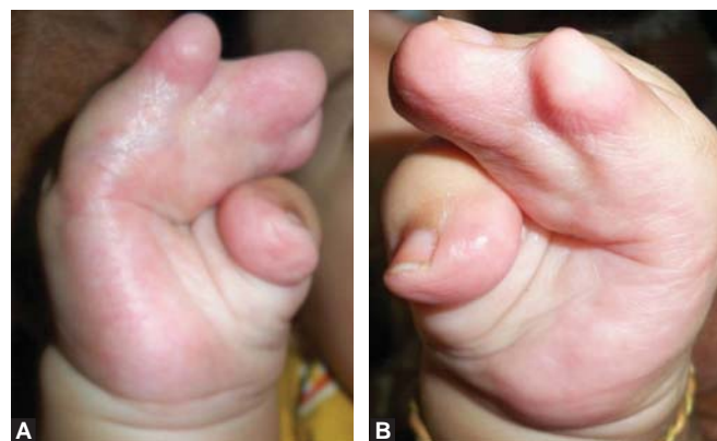
Figs 3A and B: Bilateral symmetrical syndactyly with complete fusion of all the five digits of both hands with inwardly placed thumb