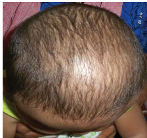
Fig. 2: Dome-shaped protruberance in anterior parietal region and increased height of the skull