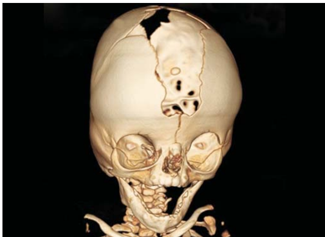
Fig. 9: Bilateral symmetric synostosis of coronal and lambdoid sutures

a result they do not produce the fibrous material required for normal calvarial sutures. 2 The majority of cases are sporadic, resulting from new mutations with a paternal age effect. The prodromal characteristics of typical turribrachycephalic head shape is early craniosynostosis of coronal sutures and agenesis of sagittal and metopic sutures which results as a wide defect extending from glabella to posterior fontanelle. Also the speno-occipital and spenoethmoidal synchondrosis and early fusion of frontoethmoidal suture causes a shortened anterior and posterior cranial base with reduction in pharyngeal height. Premature fusion of sutures with continued brain growth can lead to increased intracranial pressure which can be seen as increased convolutional markings on skull radiographs. This inturn results in hypoplastic midface and a vertically accentuated craniofacial complex. Ocular proptosis, down slanting of lateral canthus and palpebral fissures (antimongoloid slant), hypertelorism are present due to shortening of the bony orbit. There is depressed nasal bridge with deviated nasal septum. The maxilla is hypoplastic and repositioned. The lips are bow shaped and often unable to form a lip seal. 3