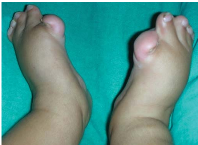
Fig. 4: Bilateral symmetrical syndactyly of both the feets with deformation of the great toes