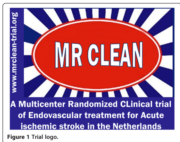
Figure 1 Trial logo.

The treatment is provided in addition to best medical management according to national and international guidelines, and may include IV thrombolysis. The study currently runs in 17 large hospitals in the Netherlands for a total period of 5 years (4 years of patient inclusion). Patient inclusion started in December 2010.