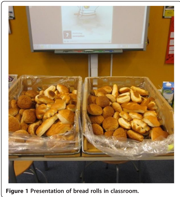
Figure 1 Presentation of bread rolls in classroom.

exchange bread rolls with them. After breakfast, children were asked to fill in a questionnaire (see Survey).