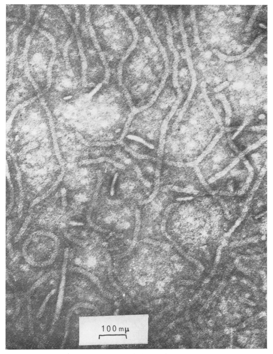
FIG. 1. LPS in 0.005 M Mg<sup>2+</sup>; negatively stained with 2% uranyl acetate.

curred only in those cell populations which sustained lethal complement damage. Very little release of label was observed from cells which survived; these presumably escape significant complement damage to their outer lipid membrane.