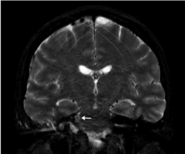
Fig. 3. Noncontrast T2-weighted MRI showing hyperintensity of the right trigeminal nerve (arrow).