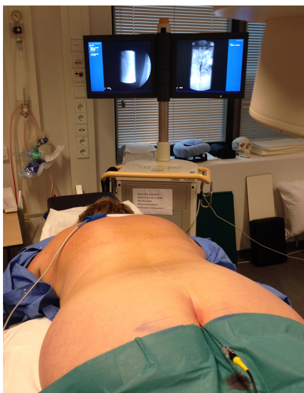
Figure 4. Ground Plate Over Vagal Nerve Neck