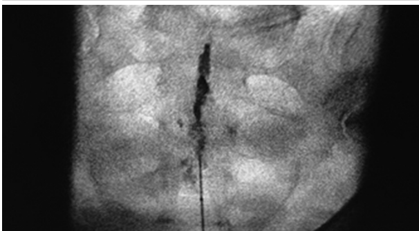
Figure 2. AP view of the epidural space after 0.5mL contrast injection, note the typical "Christmas Tree Picture"