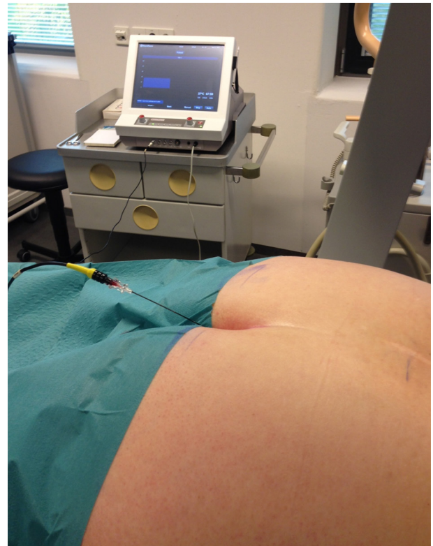
Figure 3. PRF Caudal Application