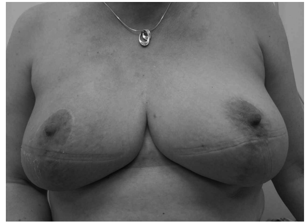
Figure 3 Postoperative photograph of patient at 1 year following therapeutic mammoplasty, radiotherapy and chemotherapy for 8cm right upper outer quadrant tumour

Among the cancer cases, 16 were oestrogen receptor positive, 15 were progesterone receptor positive and there were no cases of HER2/neu positivity. Three patients had positive lymph nodes on preoperative testing or sentinel node dissection. All of these subsequently underwent completion axillary node dissection. There were no episodes of recurrence at the most recent follow-up visit.