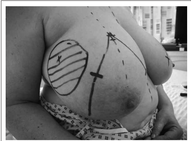
Figure 2 Preoperative photograph of patient with 8cm right upper outer quadrant tumour undergoing therapeutic mammoplasty with preoperative markings