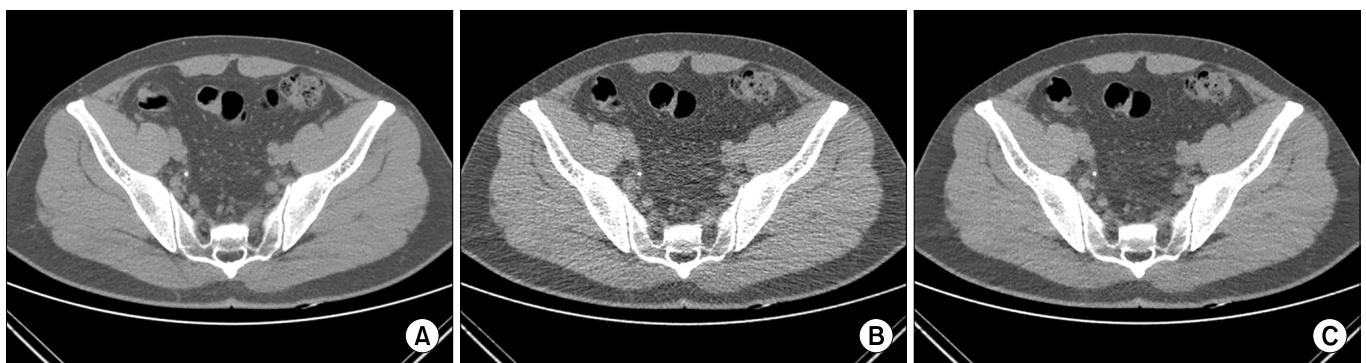
FIG. 3. Image qualities were compared on conventional nonenhanced computed tomography (A) and low-dose filtered back projection (B) with iterative reconstruction low-dose computed tomography (C).

The recent advances in imaging technology have greatly improved the chances to decrease the radiation dose while reducing image noise in CT examination. IR and model-based iterative reconstruction (MBIR) can improve image quality and reduce image noise, which were the weak