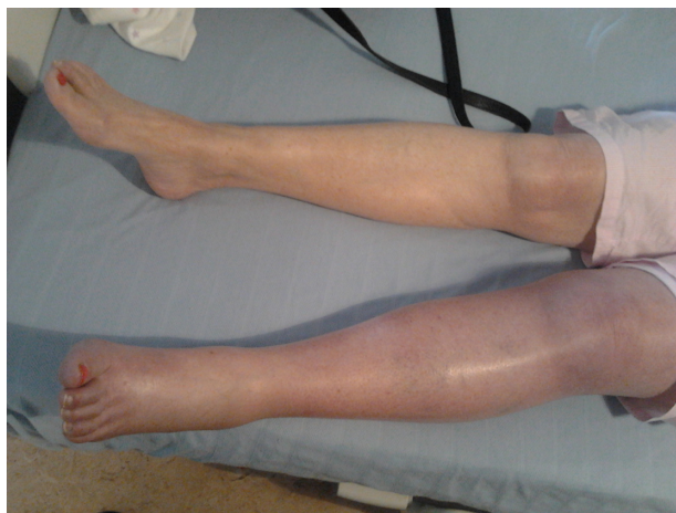
Figure 1 Left leg deep vein thrombosis.

The patient was anticoagulated simultaneously with low molecular weight heparin and warfarin sulfate.