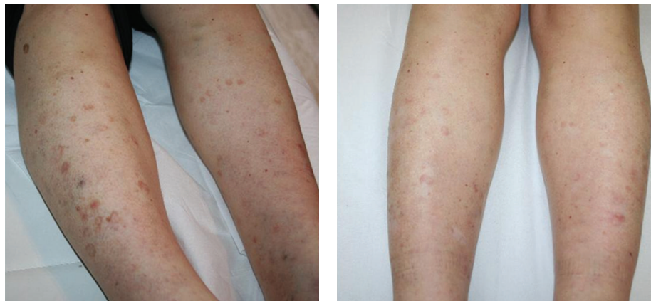
FIGURE 3: Disseminated porokeratosis: after 4 treatments, an important reduction of the hyperkeratotic edge and a reduction in the intensity of melanin have been observed.

by dermoscopy, were stable after a follow-up period ranging from 1 to 3 years.