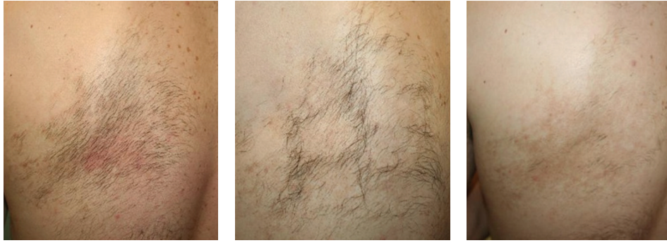
FIGURE 9: Becker's nevus: a progressive hair removal and a reduction of the hyperpigmented area were achieved to the good satisfaction of the patient.