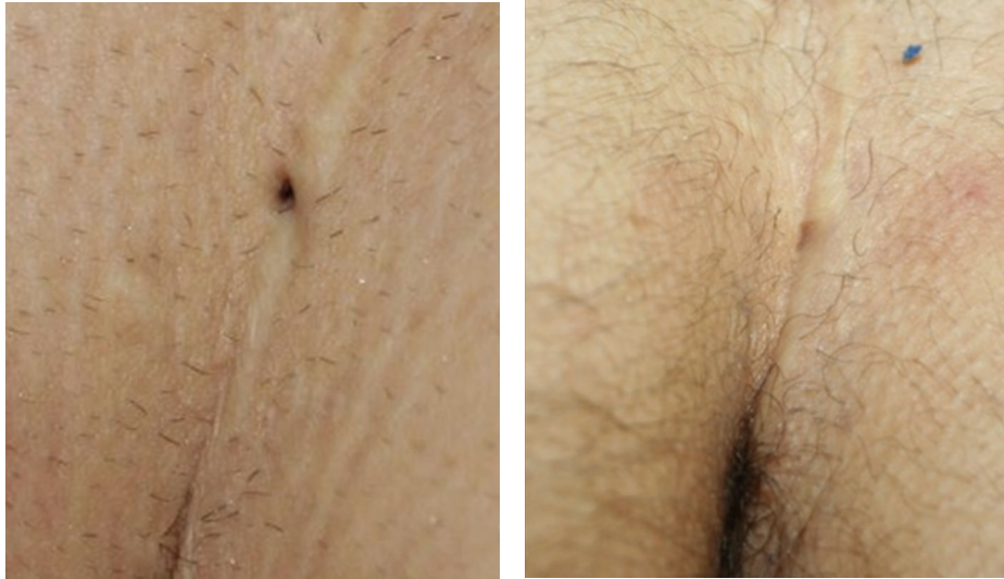
FIGURE 4: Pilonidal cyst: a complete resolution was achieved by the third session.