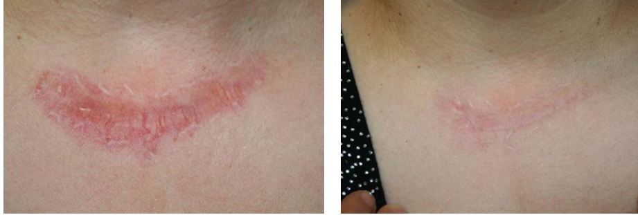
FIGURE 7: Hypertrophic scar: significant reduction of vascular component in the thicker areas before and after 3 IPL treatments.