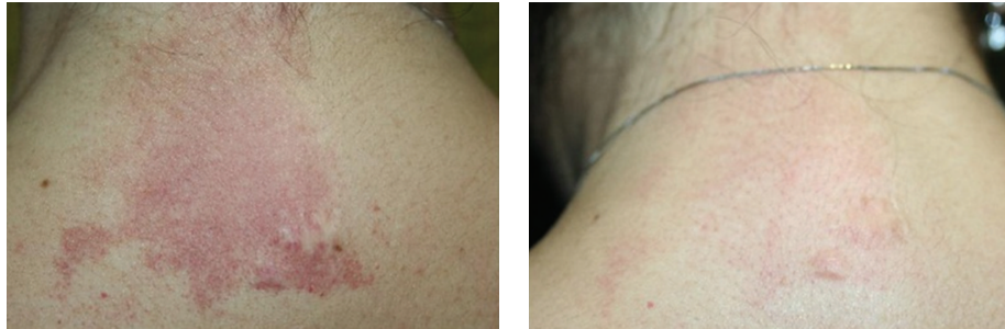
FIGURE 2: Port-wine stain: after 4 IPL sessions, the patient gained excellent results.