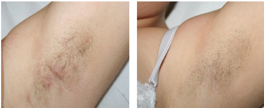
FIGURE 5: Hidradenitis suppurativa: complete resolution of pustular-papules progressive hair removal after 3 IPL treatments, bilaterally. Clinical stage I (Hurley's staging) and sartorius score of 24.