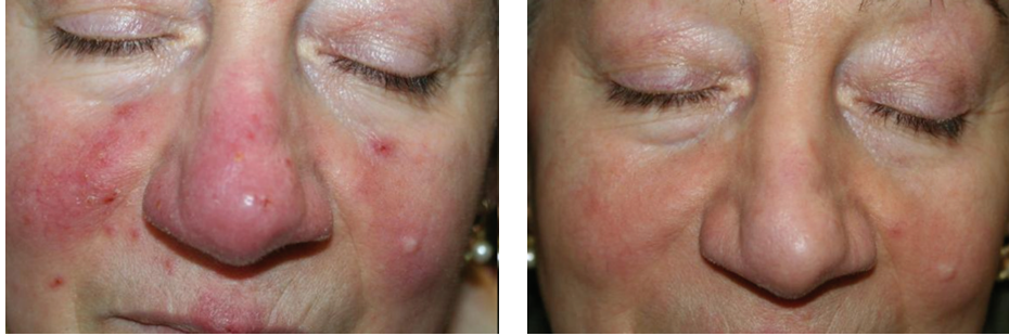
FIGURE 1: Rosacea: significant results with a significant reduction in vessel number and size and a complete disappearance of papules have been achieved after 4 IPL sessions.

All lesions were treated at intervals of 15–20 days for a total of 4 sessions per case according to the protocol shown in Table 2.