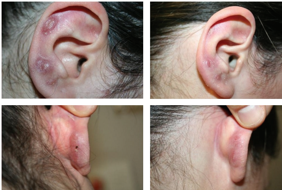
FIGURE 10: Sarcoidosis: significant reduction of the nodules with diminution of the painful sensation after 3 IPL treatments.

into different pulses, allows an additional heating which leads to coagulation of blood vessels of different diameter and different depth [1, 8]. Raulin et al. reported a 70–99% resolution of pink-coloured PWS after 2.9 treatments, of red PWS after about 1.4 treatments, and of purple PWS after an average of 2.4 sessions. In a study by Ozdemir et al., 37 patients with PWS were evaluated with results of up to 100% in 7 patients and 70–99% in 14 patients. In fact, IPL can be considered an effective treatment option. However, IPL systems require considerable experience and should be conducted with the aid of a good dermoscopy in order to determine the type of vessels to treat [34].