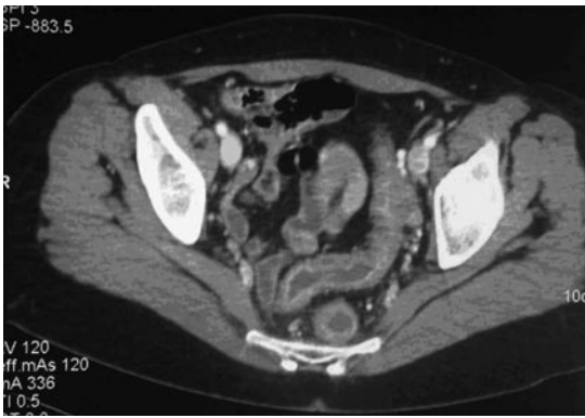
Figure 1 Contrast-enhanced CT scan of the abdomen showing a diffuse infiltration around the rectum and the sigmoid colon, and thickening of their walls.