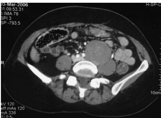
Figure 2 Well-demarcated, homogeneous mass measuring 60×50 mm in close proximity to the left iliac artery, lumbar vertebrae and psoas muscle, on contrast-enhanced CT scanning.

(WBC) of 18000 cells/mm 3 and C-reactive protein (CRP) of 1.1 mg/dL. Other values were within the normal range. At this point our differential diagnosis included diverticulitis and a contrast-enhanced computed tomography (CT) of the abdomen was performed. It revealed a diffuse infiltration around the rectum and the sigmoid colon, and a thickening of their walls (Figure 1). No diverticula were found. It also showed a well-demarcated, homogeneous, left para-aortic mass lying between the lumbar vertebrae and the left psoas muscle, which measured 60 × 50 mm (Figure 2). With few specific findings, the scan was considered inconclusive.