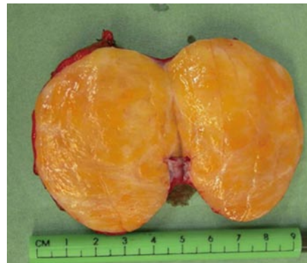
Figure 4 Perioperative examination of the mass revealed a solid, greyish, ovoid tumor with a smooth capsule and a homogeneous yellow core.

The pathologist's diagnosis was chronic colitis, more pronounced in the sigmoid colon than the left colon, and excluded IBD. In laboratory tests, WBC had fallen to a normal value at 9780 cells/mm 3 after a rise to 12000. CRP level followed the same course to settle at 1.7 mg/dL, after it had risen to 10.8. Tumor markers CEA and CA 19.9 were within the normal range. Magnetic resonance imaging showed the same features as seen with CT scanning (Figure 3).