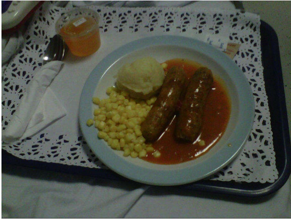
Figure 2 Example of a tweeted picture.

[@named hospital] Cannot believe I have been served this for my 18 month old. Tastes disgusting and hardly nutritional! [link to photo]