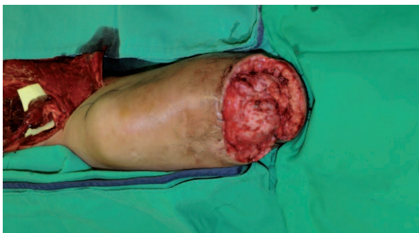
Fig. 2. BKA stump post debridement.