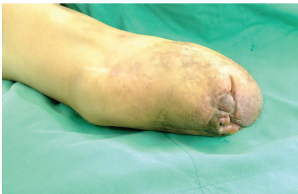
Fig. 1. Preoperative appearance of BKA stump.

was confirmed, we could confidently ligate the LCFA proximally and continue with the distal dissection. As we needed a very long pedicle, we had to dissect to within the vicinity of the communicating branches between the descending branch of the LCFA and the LSGA/profunda femoris. At this point, located between 3 and 10 cm above the lateral patella, 7 we included a cuff of vastus lateralis (Fig. 3) to preserve all collateral communications between these 2 systems and prevent any vascular compromise to the flap. We then rotated the flap 180 degrees and were able to inset under no tension into the defect over the distal tibial stump. The donor site closed primarily and no postoperative complications were encountered. The resurfaced tibial stump and donor site both subsequently healed well (Fig. 4), and the patient is now fully mobile using a below-knee prosthesis.